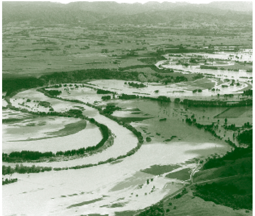
Flooding on the Ruamahanga River at Morrisons Bush east of Greytown.

Wairarapa Engineering Lifelines Association, 2003. Wairarapa Engineering Lifelines Project – Risk to lifelines from natural hazards. WELA, Masterton. (Contact: Hazards section of Greater Wellington - Regional Council, Wairarapa Division, Masterton).