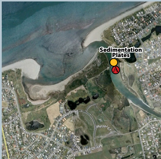
Figure 1. Location of intertidal sediment plates and fine scale monitoring site in Waikanae Estuary.

Prepared for Greater Wellington Regional Council by Leigh Stevens and Barry Robertson, Wriggle Coastal Management, March 2014