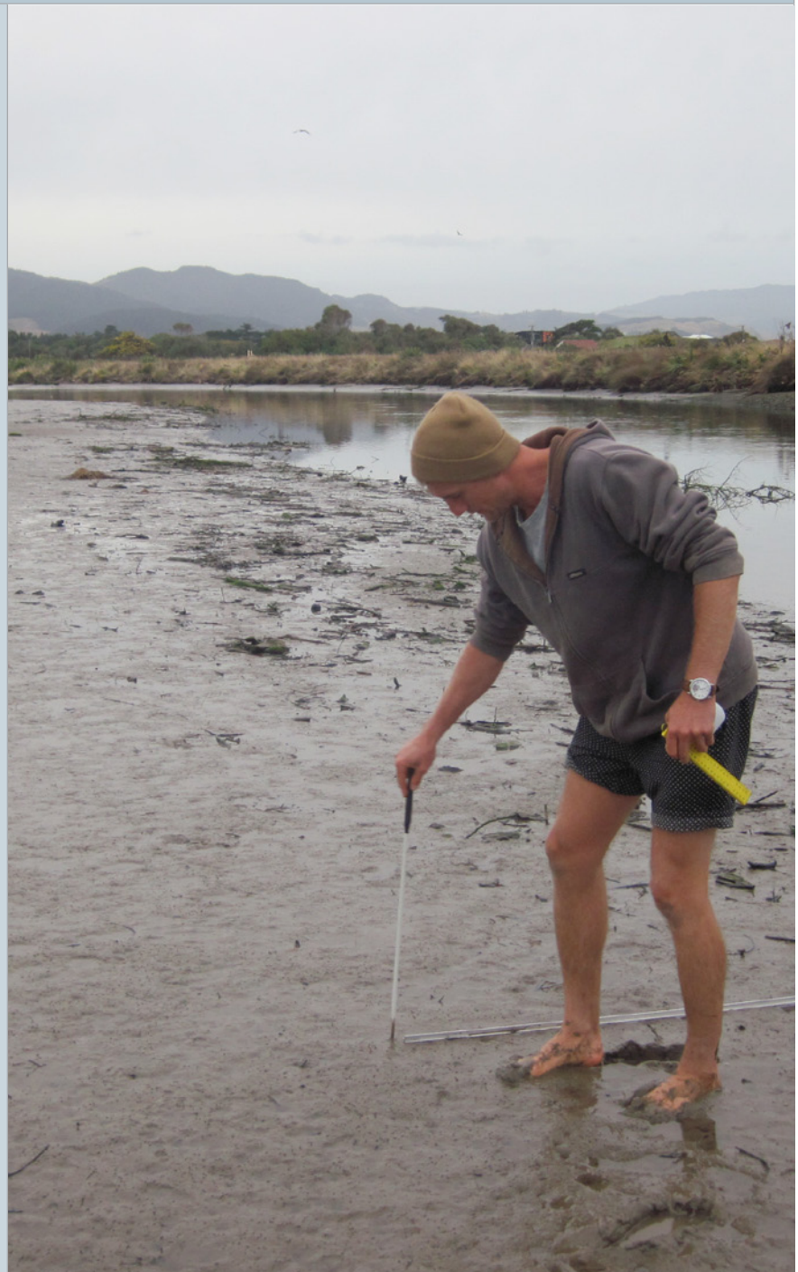
Sediment plate monitoring in Waikanae Estuary, Jan 2014