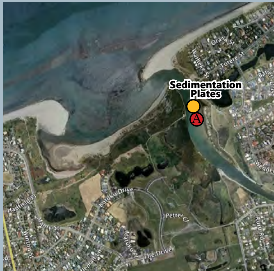
Figure 1. Location of intertidal sediment plates and fine scale monitoring site in Waikanae Estuary.

Prepared for Greater Wellington Regional Council by Leigh Stevens, Wriggle Coastal Management, April 2017