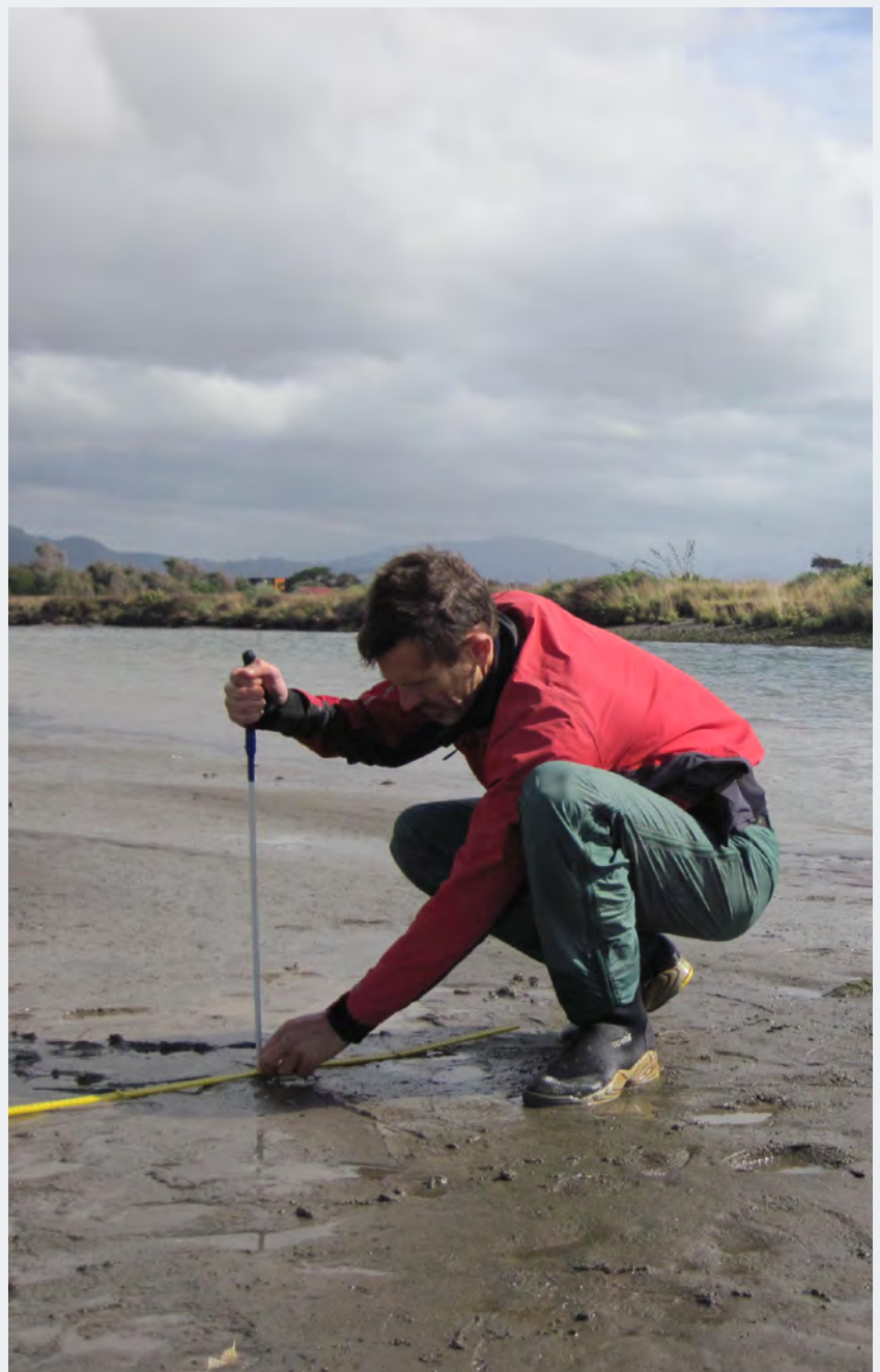
Measuring sediment plate depths in Waikanae Estuary, January 2017.