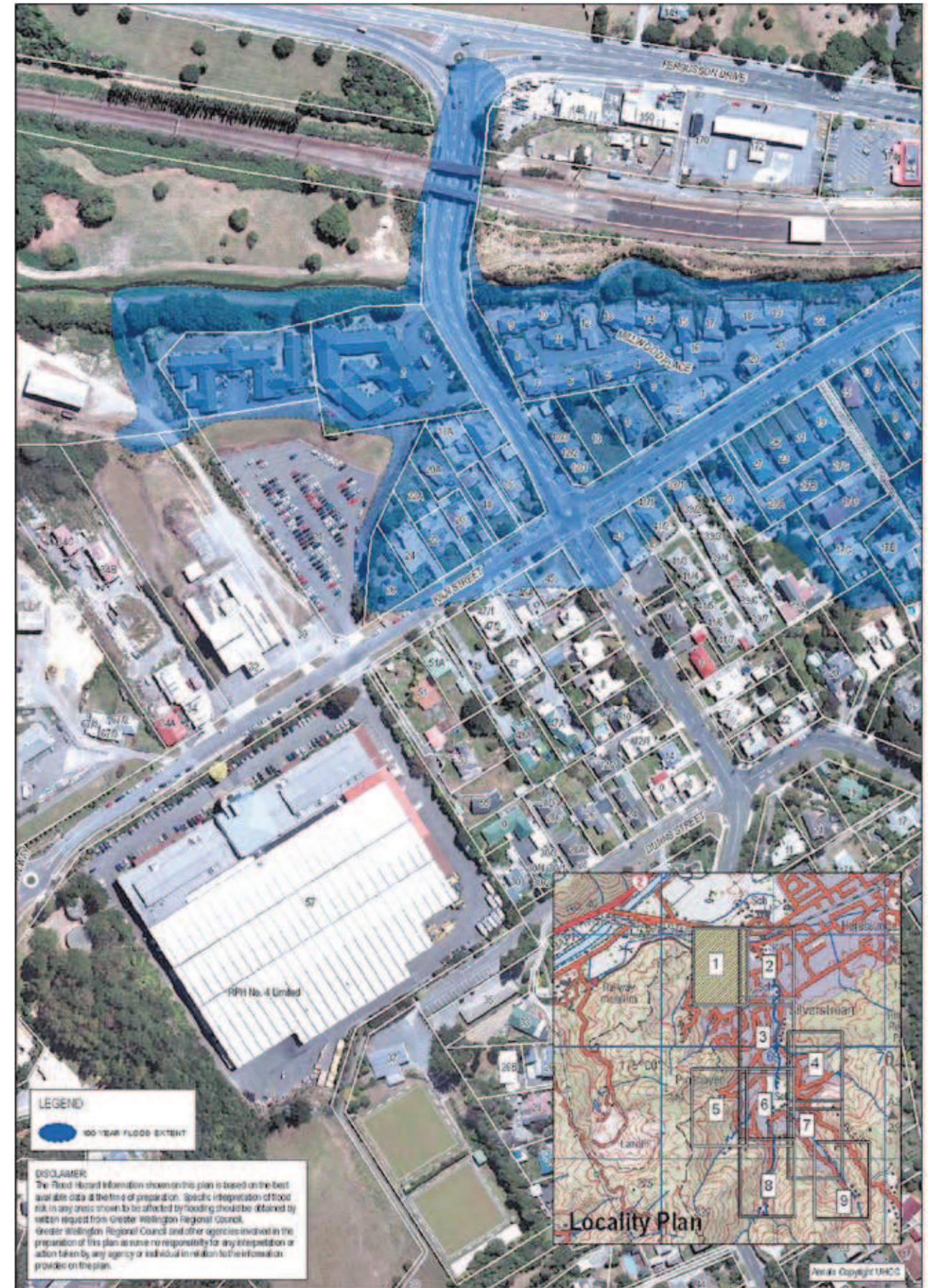
Figure 2 PINEHAVEN STREAM - Flood Hazard

Many areas in the Wellington Region are subject to flood risk. We advise that any known facts relating to the physical risk to a property should be disclosed to an insurer. This includes whether the property is exposed to any particular hazard by virtue of its location (e.g. flood). An insurer requires these facts when evaluating whether or not to underwrite the risk and, if so, on what terms.